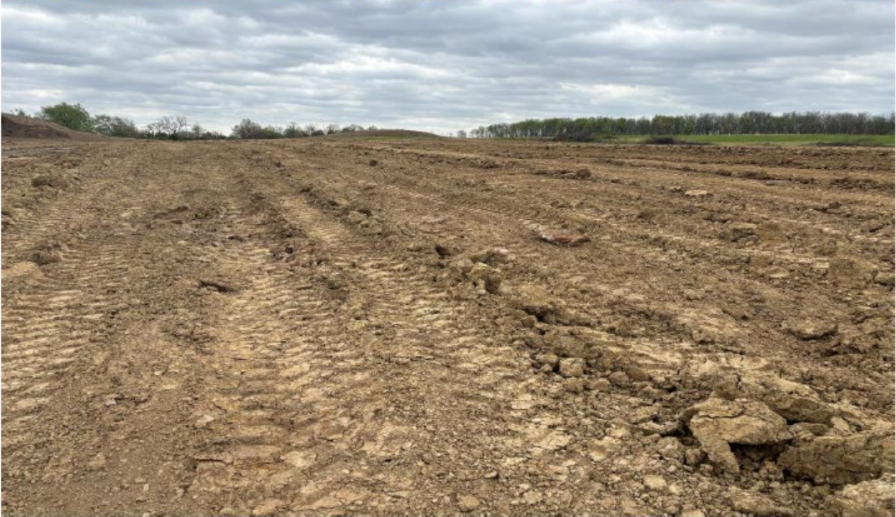
14. Overview of the former location of Drainage Feature C, facing upslope.

SUBJECT: Pre-2015 Regulatory Regime Approved Jurisdictional Determination in Light of Sackett v. EPA , 143 S. Ct. 1322 (2023), MVS-2025-271